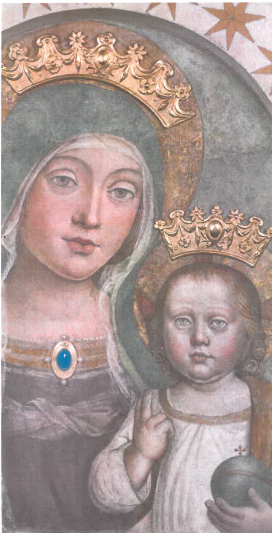
The ancient fresco of Madonna del Soccorso (Our Lady of Help) in St. Peter's Basilica was restored with the support of the Knights of Columbus to mark the Year of Faith (2012-2013).

O Mary, you always brighten our path as a sign of salvation and of hope. We entrust ourselves to you, Health of the Sick, who, at the Cross, took part in Jesus' pain while remaining steadfast in faith.